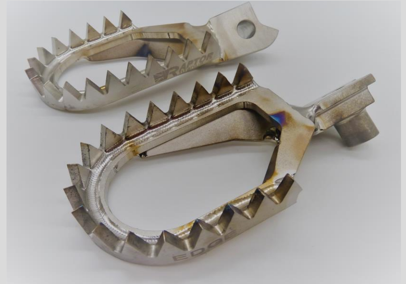
RAPTOR TITANIUM EDGE FOOTPEGS THIS FOOTPEG IS OPEN PLATFORM DESIGN, WITH NO CENTRE ROW OF TEETH