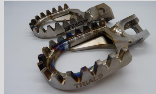
RAPTOR TITANIUM TRIALS FOOTPEGS