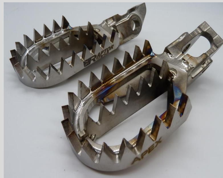
RAPTOR TITANIUM APEX FOOTPEGS THIS FOOTPEG MODEL HAS CENTRE ROW OF TEETH